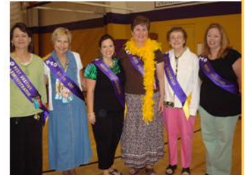
Teachers are honored during Teacher Appreciation Week for participation in PTO events.