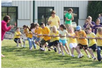
Tug of War ... our timeless Field Day event!

THANK YOU FOR THE AWESOME PRIVILEGE OF LEADING PTO! We send our sincere appreciation to all who partnered with us to help make our events possible this year.